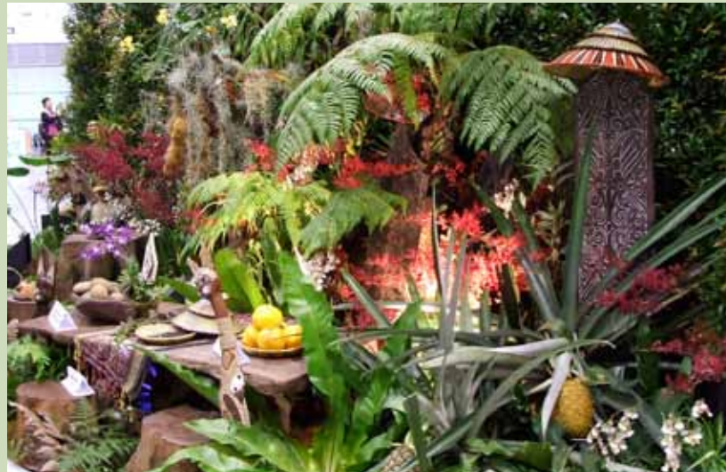
Top: Teck Whye Secondary School's remarkable landscape was awarded the Grand Champion Display trophy, as well as a trophy for Best Educational Institution Display. Above: Best Landscape Display (10sqm) by Orchidwoods Co. Below: Taiwan Orchid Growers Association's winning landscape.