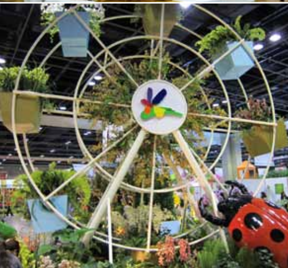
Clockwise from top left: Naval Base Secondary School landscape; Den. sutiknoi ; Woon Leng Nursery's floral window exhibit won second prize; Best Other Species winner Bifrenaria tetragona exhibited by Woon Leng Nursery; Podangis dactyloceras ; as host of the Asia Pacific Orchid Conference 2013, Okinawa's landscape display also advertises their 27th International Orchid Show; Dept. of Agriculture, Orchid Society of Thailand; a spectacular ferris wheel by Singapore Botanic Gardens won a Gold Medal.