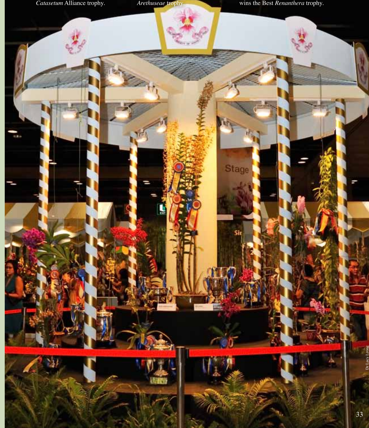
Renanthera 20thWOC Singapore 2011 wins the Best Renanthera trophy.