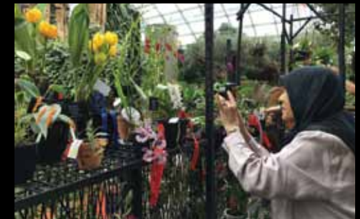
Above: The show is a delight for both amateur and professional photographers. Below: The Phalaenopsis section.