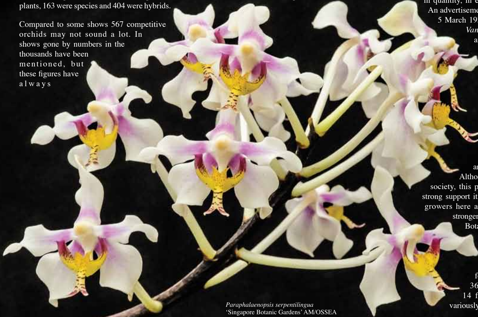
Paraphalaenopsis serpentina 'Singapore Botanic Gardens' AM/OSSEA

The competitive plants came from a total of 34 exhibitors: 10 professionals from Germany, Japan, Malaysia, Taiwan and Thailand, 10 professionals from Singapore, and 14 amateurs, all from Singapore. Although OSSEA is an amateur society, this participation indicates the strong support it enjoys from professional growers here and overseas. None gave stronger support than the Singapore Botanic Gardens and Gardens by the Bay, both of which sent numerous excellent plants from their own collections. We were fortunate to have available 36 well-qualified judges, 14 from Singapore and 22 variously from Australia, Germany,